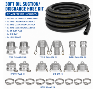
30ft Aluminum Camlock Hose Kit

Since 2009, we have been supplying portable and stationary pumps for moving all types of oil. Oil cleaning centrifuges are also important tools to re-use oil as fuel or lubricant.