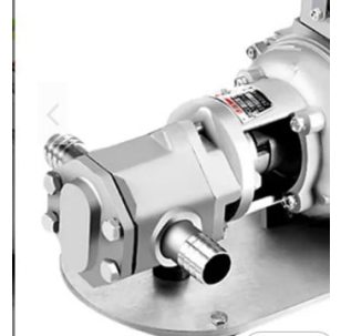
Stainless Steel 12GPM Oil Transfer Pump Head

Since 2009, we have been supplying portable and stationary pumps for moving all types of oil. Oil cleaning centrifuges are also important tools to re-use oil as fuel or lubricant.