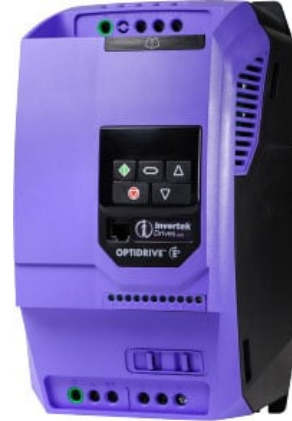
3HP VFD for 25GPM Pump Indoor