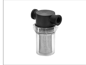
In Line Suction Strainer 1"