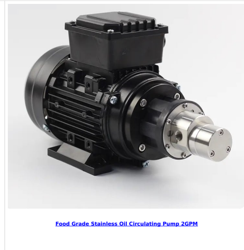
Food Grade Stainless Oil Circulating Pump 2GPM

Since 2009, we have been supplying portable and stationary pumps for moving all types of oil. Oil cleaning centrifuges are also important tools to re-use oil as fuel or lubricant.