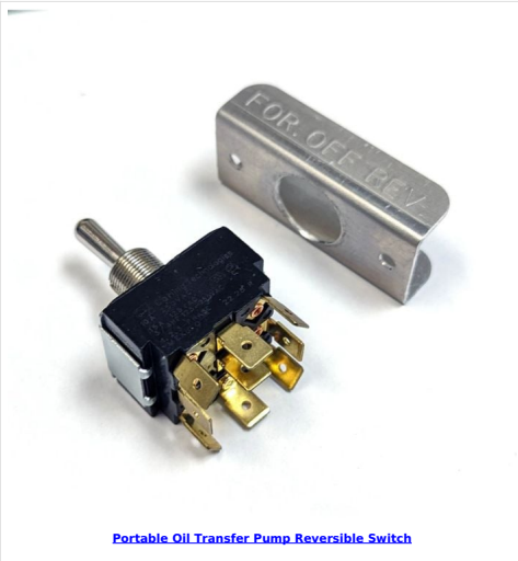
Portable Oil Transfer Pump Reversible Switch