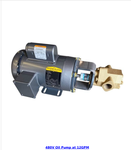
480V Oil Pump at 12GPM