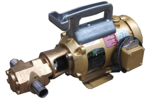
Industrial Oil Transfer Pump - 25GPM -3 Phase