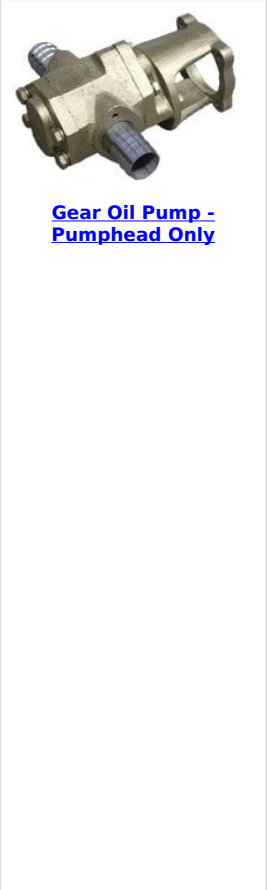
Gear Oil Pump - Pumphead Only