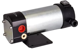
12V Oil Transfer Pump 3GPM