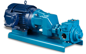
Blackmer XP Vane Pump GNX2A

Since 2009, we have been supplying portable and stationary pumps for moving all types of oil. Oil cleaning centrifuges are also important tools to re-use oil as fuel or lubricant.