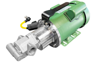
Mean Green Oil Pump - 7GPM

Since 2009, we have been supplying portable and stationary pumps for moving all types of oil. Oil cleaning centrifuges are also important tools to re-use oil as fuel or lubricant.