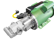
Mean Green Oil Pump - 7GPM