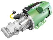
Mean Green Oil Pump - 7GPM