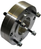
Gas Motor Plate Adapter

Since 2009, we have been supplying portable and stationary pumps for moving all types of oil. Oil cleaning centrifuges are also important tools to re-use oil as fuel or lubricant.