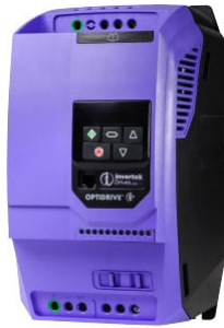
3HP VFD for 25GPM Pump Indoor