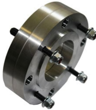
Gas Motor Plate Adapter