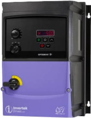
2HP VFD for Pump - Switched Outdoor