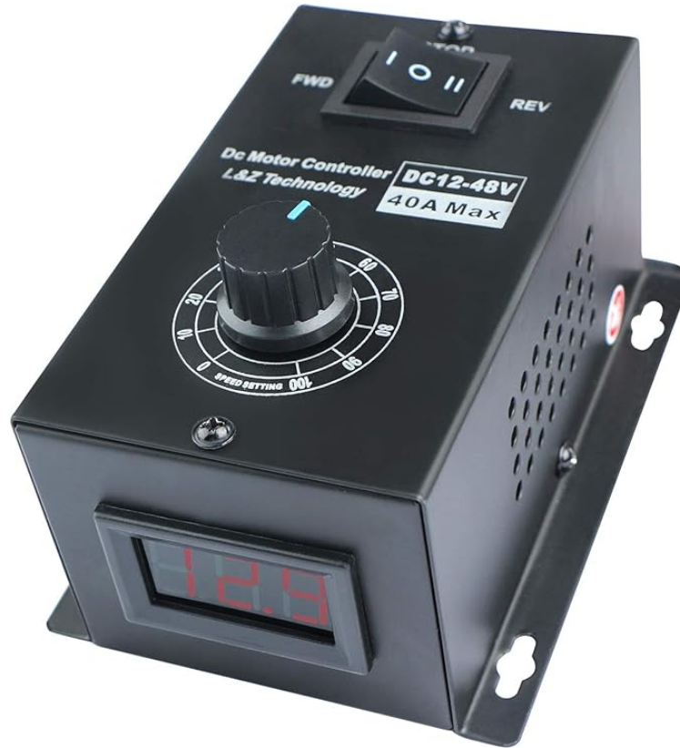
12-48v Variable Speed Controller