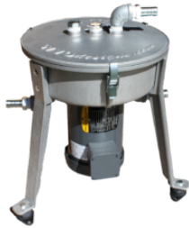
Basic Oil Centrifuge