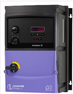
2HP VFD for Pump - Switched Outdoor