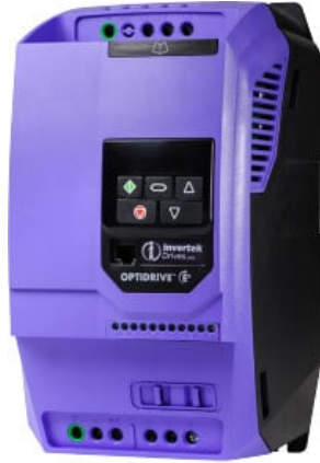
3HP VFD for 25GPM Pump Indoor