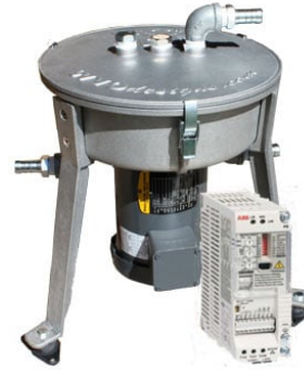
Extreme Oil Centrifuge

Since 2009, we have been supplying portable and stationary pumps for moving all types of oil. Oil cleaning centrifuges are also important tools to re-use oil as fuel or lubricant.