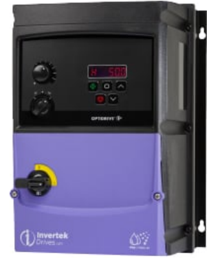
1HP VFD for 12GPM Pump - Switched Outdoor

50Hz Portable Oil Transfer Pump - Massive Gears