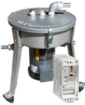
Suction Strainer for Pumps