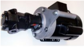
50Hz Oil and Diesel 80 liters/min