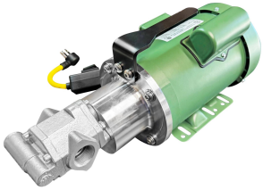
Mean Green Oil Pump - 7GPM