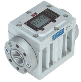
39 GPM Digital Oil Flow Meter 1.5"

Since 2009, we have been supplying portable and stationary pumps for moving all types of oil. Oil cleaning centrifuges are also important tools to re-use oil as fuel or lubricant.