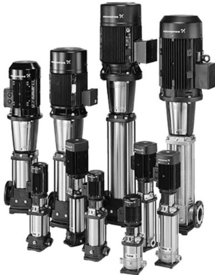
High Flow DEF Pump - High Pressure