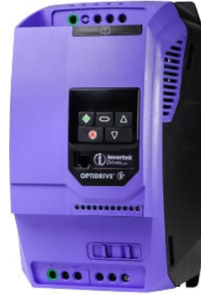
Centrifuge Oil Pre Heater