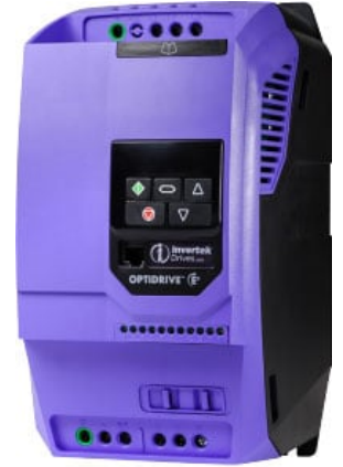
3HP VFD for 25GPM Pump Indoor

Since 2009, we have been supplying portable and stationary pumps for moving all types of oil. Oil cleaning centrifuges are also important tools to re-use oil as fuel or lubricant.