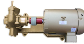
Industrial Oil Transfer Pump - 60GPM