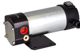
12V Oil Transfer Pump 3GPM