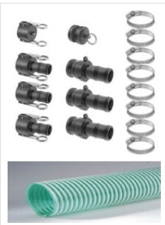
Oil Pump Hose Kit - 1.25 Inch