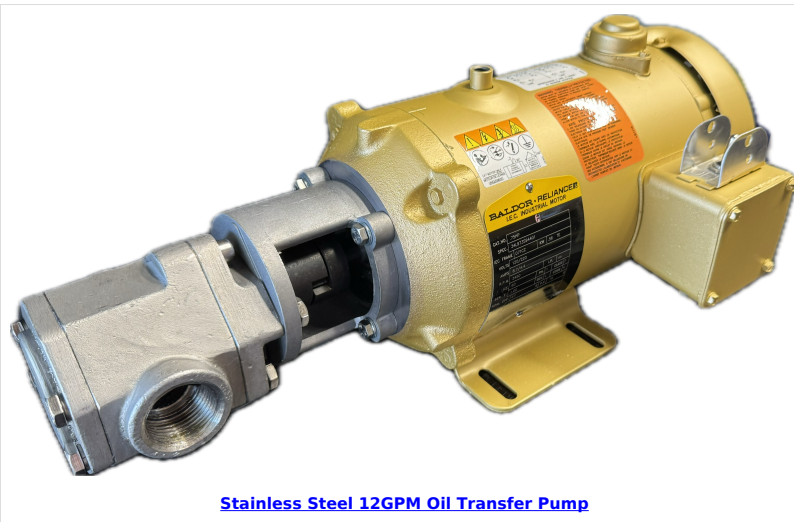
Stainless Steel 12GPM Oil Transfer Pump