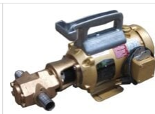
25GPM Portable Oil Transfer Pump - Massive Gears