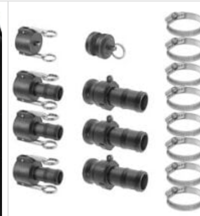
Oil Pump Hose Kit - 1.25 Inch