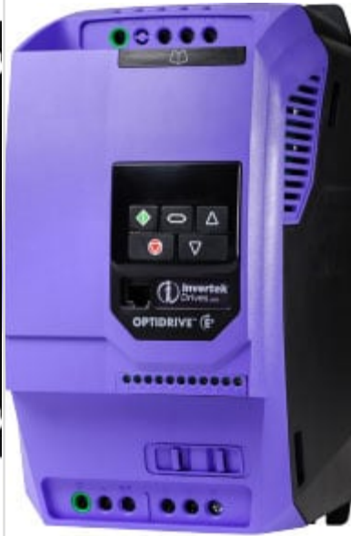
7.5HP VFD for 60GPM Pump Indoor