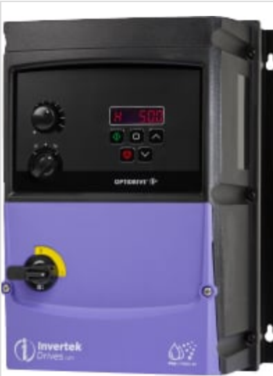
7.5HP VFD for 60GPM Pump Outdoor