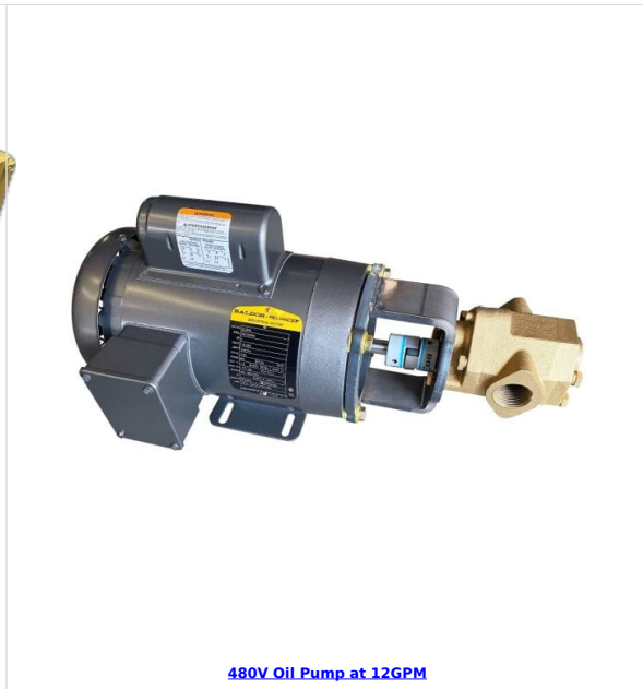
480V Oil Pump at 12GPM