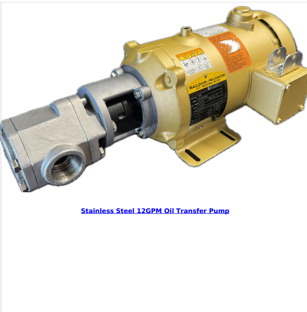
Stainless Steel 12GPM Oil Transfer Pump