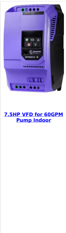
7.5HP VFD for 60GPM Pump Indoor