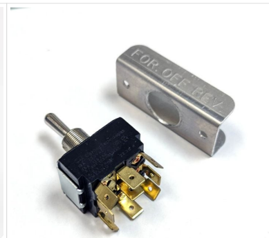
Portable Oil Transfer Pump Reversible Switch

Since 2009, we have been supplying portable and stationary pumps for moving all types of oil. Oil cleaning centrifuges are also important tools to re-use oil as fuel or lubricant.