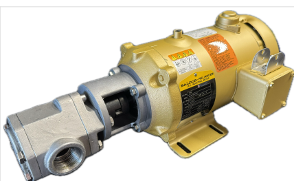
Stainless Steel 12GPM Oil Transfer Pump