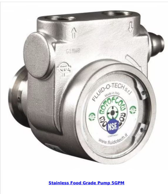
Stainless Food Grade Pump 5GPM