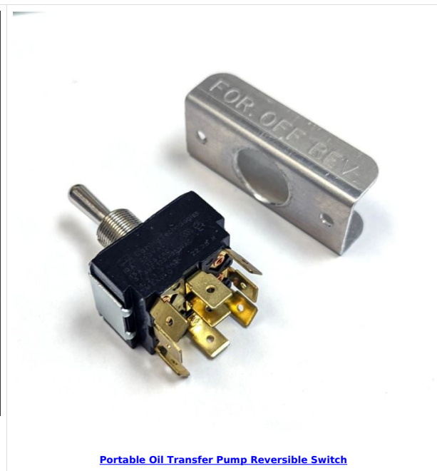
Portable Oil Transfer Pump Reversible Switch

Since 2009, we have been supplying portable and stationary pumps for moving all types of oil. Oil cleaning centrifuges are also important tools to re-use oil as fuel or lubricant.