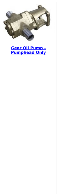
Gear Oil Pump - Pumphead Only