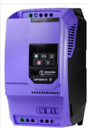
7.5HP VFD for 60GPM Pump Indoor