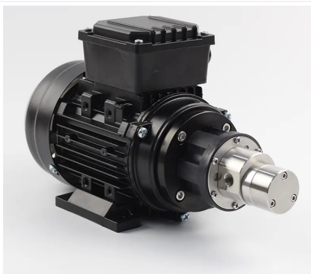
Food Grade Stainless Oil Circulating Pump 2GPM