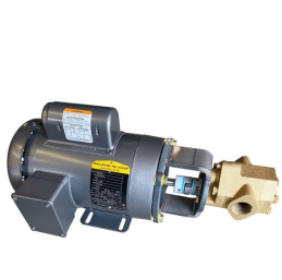
480V Oil Pump 25GPM