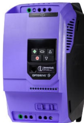
7.5HP VFD for 60GPM Pump Indoor