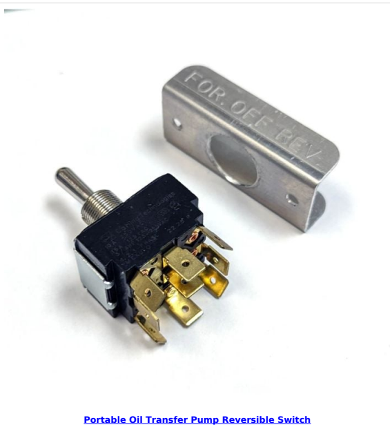
Portable Oil Transfer Pump Reversible Switch