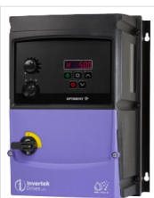
7.5HP VFD for 60GPM Pump Outdoor