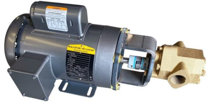
Super HD Heavy Oil Transfer Pump

Since 2009, we have been supplying portable and stationary pumps for moving all types of oil. Oil cleaning centrifuges are also important tools to re-use oil as fuel or lubricant.