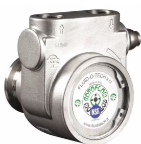
Stainless Food Grade Pump 5GPM