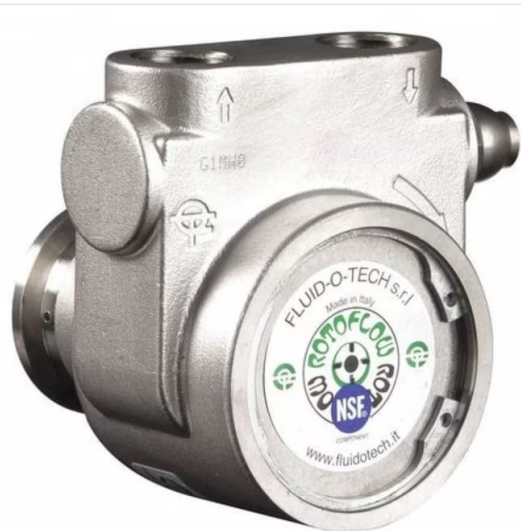
Stainless Food Grade Pump 5GPM