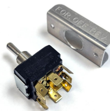
Portable Oil Transfer Pump Reversible Switch