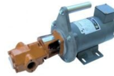
24GPM 12V Oil Transfer Pump