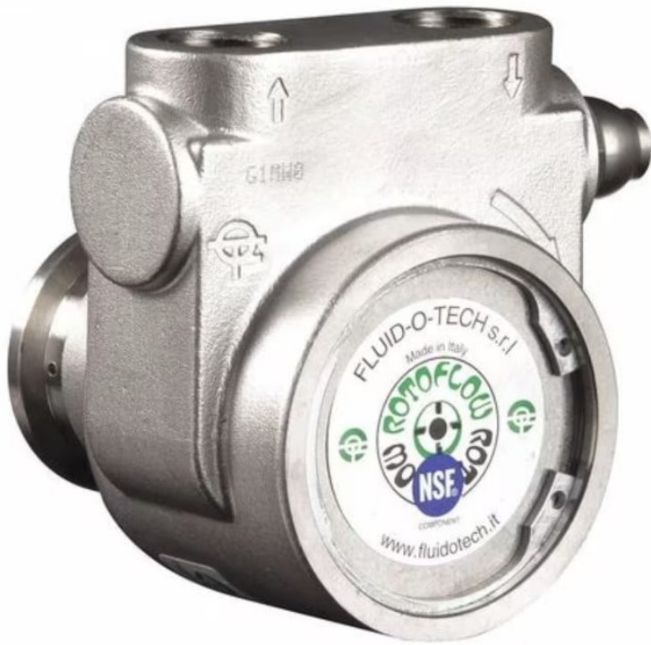
Stainless Food Grade Pump 5GPM