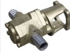
Gear Oil Pump - Pumphead Only