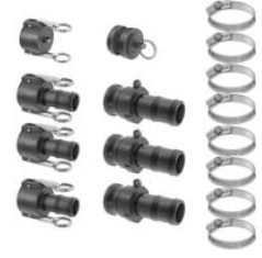
Oil Pump Hose Kit - 1.25 Inch

Since 2009, we have been supplying portable and stationary pumps for moving all types of oil. Oil cleaning centrifuges are also important tools to re-use oil as fuel or lubricant.