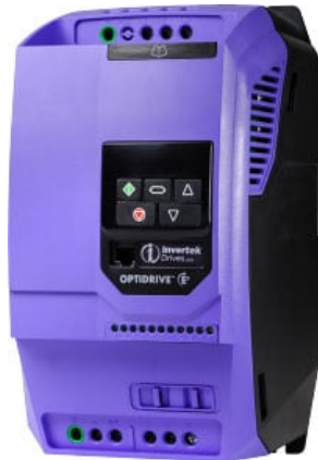
7.5HP VFD for 60GPM Pump Indoor