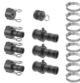
Oil Pump Hose Kit - 1.25 Inch