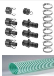
Oil Pump Hose Kit - 1.25 Inch