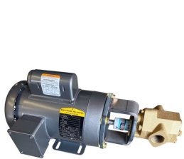
480V Oil Pump at 12GPM