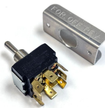
Portable Oil Transfer Pump Reversible Switch