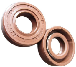
Portable Pump Shaft Seal