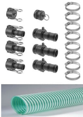
Oil Pump Hose Kit - 1.25 Inch